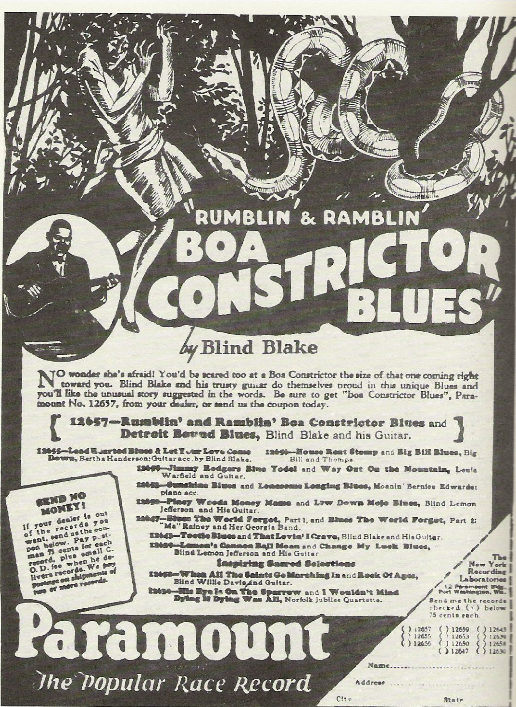
Advertisement for "Boa Constrictor Blues." Chicago Defender 25 August 1928.